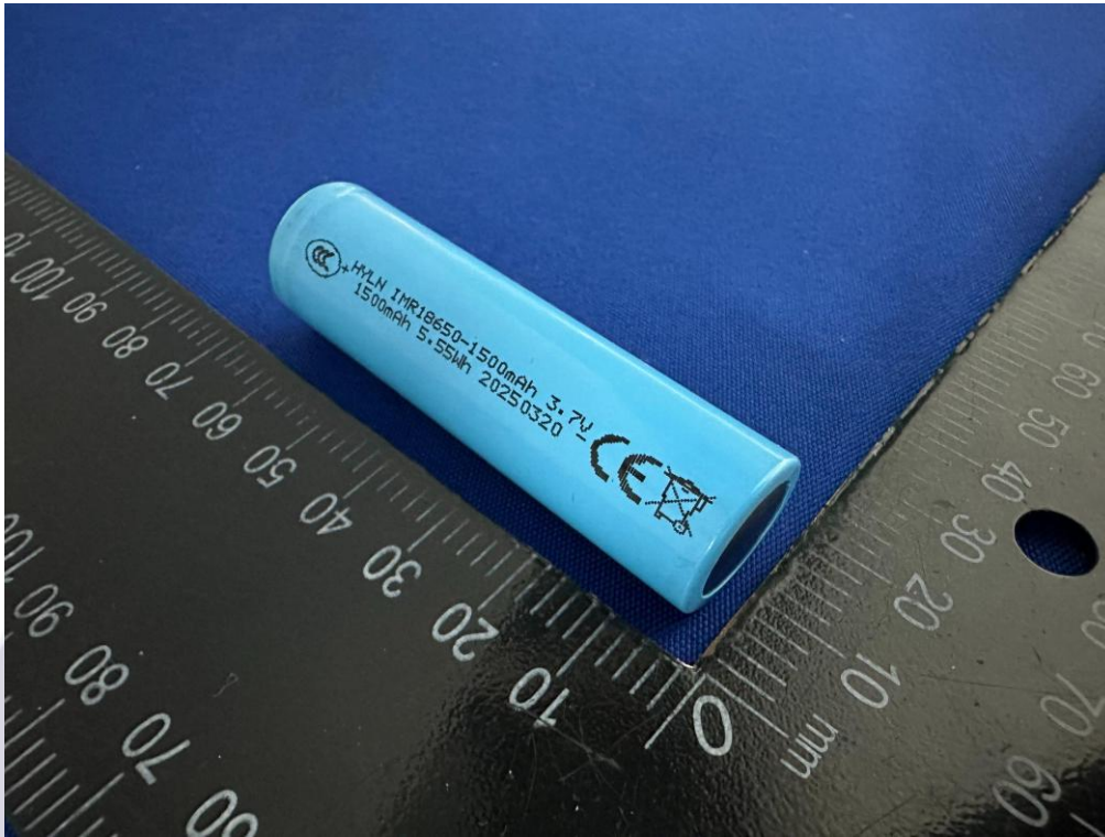
Picture 1. Front view of battery